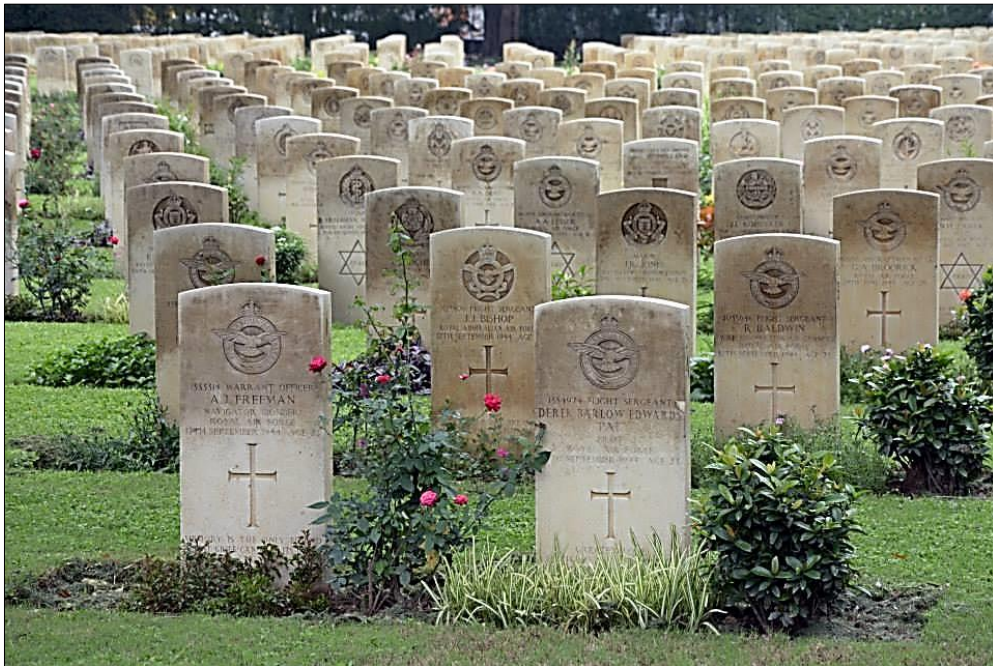
Headstones arranged in a perfect geometrical symmetry at Rancho War Cemetery

He was buried at RANCHI WAR CEMETERY, India among 703 casualties, in plot 9.F.4. Ranchi is a town in the State of Jharkhand, 419 kilometres. north-west of Calcutta